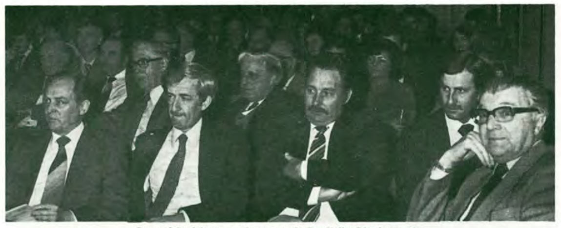
Some of the delegates and guests at the Dee Valley District meeting.